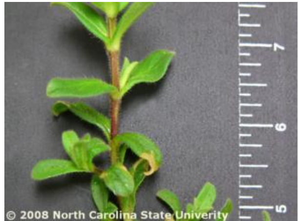
mouseear chickweed stem

Note: Still not sure this is the right weed? The Turf & Weed Identification Decision Aid may help. Check the TurfFiles glossary for definitions of unfamiliar terms.