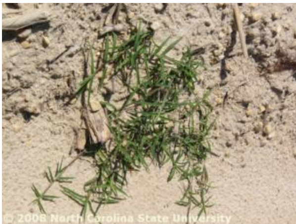
bermudagrass (as a weed)