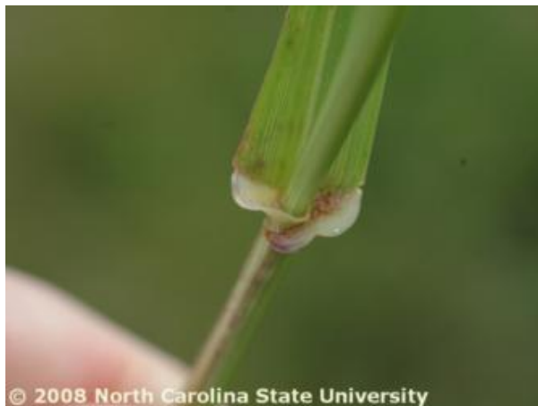
annual ryegrass, clasping auricles